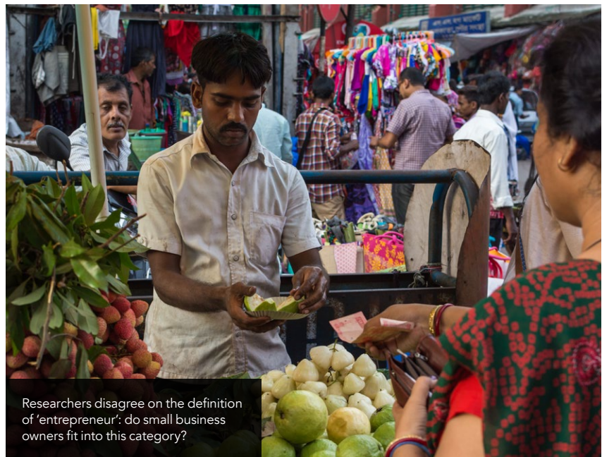
Researchers disagree on the definition of 'entrepreneur': do small business owners fit into this category?