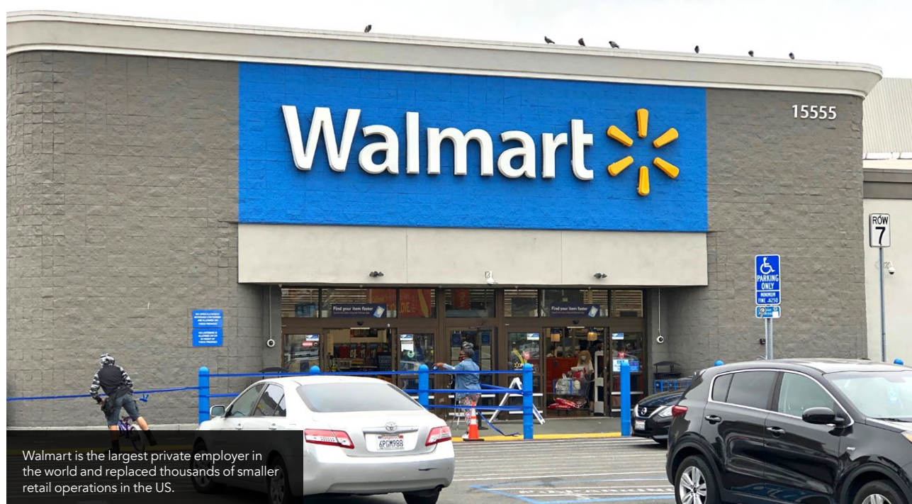
Walmart is the largest private employer in the world and replaced thousands of smaller retail operations in the US.

and policy aims. However, other studies may adopt a single grouping for entrepreneurialism to investigate conditions shared by Schumpeterian and routine business owners, including self-employment, reacting to opportunity, and dealing with risk and uncertainty. Each approach to understanding the entrepreneur therefore has its place, but how would the former variables be