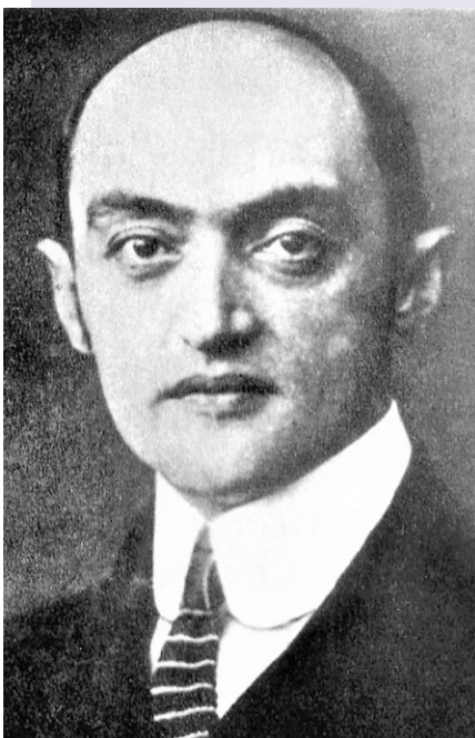
Joseph Schumpeter coined the term 'disruptive innovation'.

Schumpeter’s definition of entrepreneurship is influential but abstract, making it difficult to incorporate