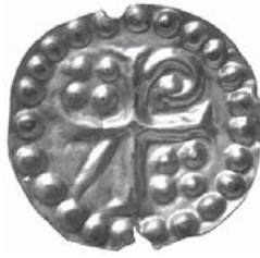
Fig. 33. Sigtuna (?), Archbishops of Uppsala (1210–1215). Cross with crosier in the diagonal, 4 pellets in the other angles, 0.24 g, Ø 17 mm, LL IB:3.