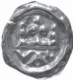
Fig. 40. Unknown mint, King Valdemar (1250–1275). Crown, VAL, 0.14 g, Ø 14 mm, LL XVI:3b.

In 1275, Duke Magnus started a rebellion against his brother, King Valdemar, with Danish help, and ousted him from the throne. It is during the reign of King Magnus III Barnlock (1275–1290) that Svealand and Götaland were joined in a common currency area. Both Svealand and Götaland then minted corresponding types, but the Svealand types were double the weight of the Geatish ones. It is believed that the bracteates were regarded as valid in both areas. 75 The first main type was a crown in a smooth edge, dated to the period 1275–1279 (see Fig. 41). In Svealand, these were minted by Magnus III in various mints. 76