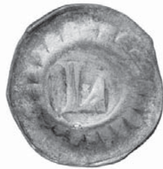
Fig. 54. Lödöse, King Magnus IV (1319–1363), struck 1354–63. L, ray edge, 0.41 g, Ø 15 mm, LL XXVIII:2c.

There is a break in the minting of bracteates for c. 65 years between 1290 and 1354. In the latter year, the two-faced pennies (Fig. 53) were exchanged for hohlpfennigs with a crown or letter in ray edges (Figs. 54–56). It is important to mention the Black Death ( c. 1350–1355) here, as afterwards, the state finances must have been in extreme crises. The fineness of these bracteates fell continuously from 45 to 10 per cent until 1363. People’s confidence in the coinage must have been in freefall, as it appeared close to collapse. It was this backdrop that led to the system being reformed in 1363. The hohlpfennigs with ray edges were replaced by hohlpfennigs with a letter and smooth edge (see Figs. 57–59). The new hohlpfennigs had a fineness of around 90 per cent and were struck until 1365. 98