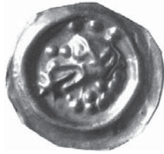
Fig. 39. Lödöse, King Valdemar (1250–1275). Crowned lion head right, 0.13 g, Ø 12 mm, LL XVII:7.