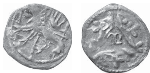
Fig. 53. King Magnus IV Ericsson (1319–1363), unknown mint, struck 1340–1354. Lion left)(Rounded M between three crowns, 0.34 g, Ø 12 mm, LL XXVII:6b.

According to Edvinsson the debasements of fineness accelerated in the period 1352–54. Non-Swedish written sources based on the payment of Peter's penny to the Pope claim that the exchange rate between mark silver and mark pennies had deteriorated from 1:5 to 1:8 in a few short years. 95 However, it is uncertain which specific Swedish coin type can be linked to this debasement. 96 It is quite plausible to argue that the Swedish church paid the Pope with debased Norwegian pennies. According to Lagerqvist, 97 Sweden and Norway may have had a possible mon-