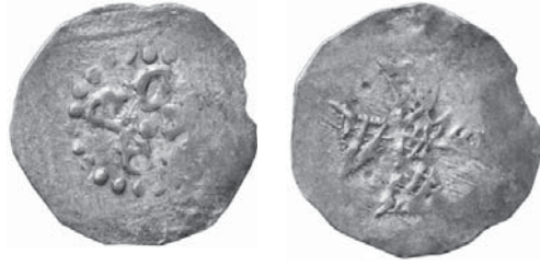
Fig. 69. Visby, c.1220–1280, penny. Some letters around a pellet )( Squared cross, 0.19 g, Ø 12 mm, LL XXII:3.

In principle, it is the same main type of W-bracteates that were coined for over 160 years. During this period, the type had different pearled edges and details, which could represent control marks of the coin issuer. The silver fineness for both the gotes and the bracteates severely declined in the 1440s.