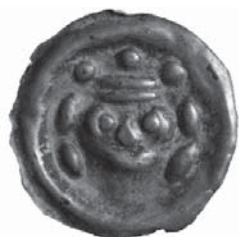
Fig. 37. Örebro, King Valdemar (1250–1275). Crowned head facing, 0.19 g, Ø 12 mm, LL XVII:2.