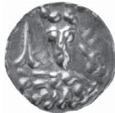
Fig. 7. Sigtuna, King Canute I (1167–1196), struck after 1180. Crowned bust with head facing between sword and key (?), degenerated style, 0.34 g, Ø 16 mm, LL IA:7c.

10 coins) from the reign of Canute I. The composition of these hoards is strongly skewed with respect to various bracteate types (compare with method C in Table 1). Often, one or a couple of types dominate, indicating that they are late types, e.g. the hoards from Gillberga and Mackmyra. 62 The hoard from Gillberga in Uppland contained 457 bracteates from Canute's era, distributed in four types. Of these, more than 99 per cent are of two types; 431 of one type ( LL IA:7a-c ) and 22 of another ( LL IA:12 ) (Figs. 7 and 8). The Mackmyra hoard from Gästrikland had 235 bracteates distributed in 13 types, with 108 of one type ( LL IA:7d ) and 21 of a closely related type ( LL IA:7a-c ). Two other distinctive types ( LL IA:5a-c and LL IA 1a-b ) have 38 and 32 specimens, and six types are evidenced by a maximum of two coins each. It is difficult to imagine coin hoards more unbalanced than these in order to support the view that the types are chronological issues. In Germany and Denmark, we are quite certain that periodic recoinage occurred, based on written sources. However, German and Danish coin hoards are seldom if ever as unbalanced as Swedish hoards from this period. 63