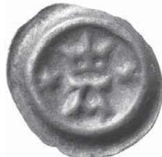
Fig. 67. Åbo, King Charles VIII (1448–1457, 1464–1465, 1467–1470). Crowned A with two stars in field, 0.25 g, Ø 13 mm, LL XXXIII:1d, Malmer KrAYIIa.