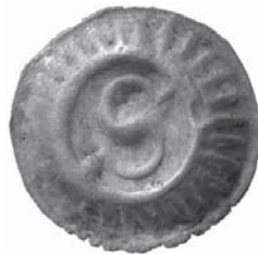
Fig. 55. Stockholm, King Magnus IV (1319–1363), struck 1354–63. S, ray edge, 0.33 g, Ø 15 mm, LL XXVIII:3a.