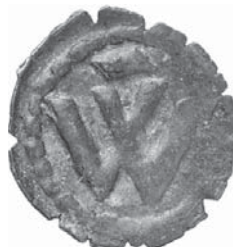
Fig. 71. Visby c.1280–1400, penny. W, 0.09 g, Ø 11 mm, LL XXXIV:1b.