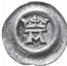
Fig. 66. Västerås, King Albert of Mecklenburg (1364–1389). Crowned A, 0.25 g, Ø 15 mm, LL XXXIII:1b, Malmer KrAÄa.