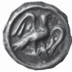
Fig. 20. Lödöse, King Eric XI (1222–1229, 1234–1250), struck 1234–1240. Bird turned to the right, 0.16 g, Ø 14 mm, LL XII:B:5.