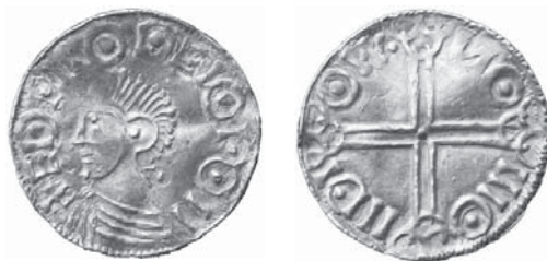
Fig. 1. Imitation of English long-cross type, Sigtuna (Svealand), Olof Skötkonung (995–1022). Bust of uncrowned king turned to the left) (Double-lined cross, confused legends, 1.28 g, Ø 19 mm, SMH 224.

In the Sigtuna mint (Svealand), two-faced coins inspired by English coins were struck from around 995 to 1030 (Fig. 1). Studies of dies and die-links show that the quantity of minting in Sigtuna was considerable during this period. 39 The regional chiefs, Olof Skötkonung and his son Anund Jacob were the coin issuers. No real state called Sweden existed during this period. The minting ceased around 1030 for hitherto unexplained reasons.