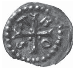
Fig. 10. Nyköping (Svealand), King Eric X (1208–1216). Cross in a pearled circle, A-R-O-S in angles, 0.36 g, Ø 16 mm, LL IB:4.

Svealand types is a cross in a pearled circle with various details in the cross angles (Figs. 10 and 11), and the Geatish type shows a crowned head (Fig. 12). 66 The Svealand issues indicate that the types were changed every two or three years. Waste products from minting of one of the types have been found in the Nyköping mint, indicating that it was minted there. However, this fact does not exclude that this type was also struck in other Svealand mints. There are many variants of the Geatish type with the image of a crowned head (legend: variants with ERIC REX). It is unclear whether these are different chronological issues in time.