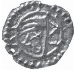
Fig. 34. Unknown mint (Svealand), Earl under the reign of Canute the Tall (1229–1234). Banner to the left, pearly edge, legend: VI-CA, 0.17 g, Ø 17 mm. LL IV:8a.