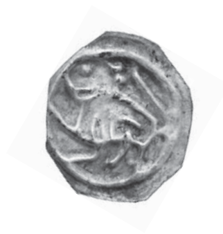
Fig. 9. Lödöse, King Sverker II the Younger (1196–1208). Lion turned to the left, 0.13 g, Ø 13 mm, LL XII:4.

Svealand types is a cross in a pearled circle with various details in the cross angles (Figs. 10 and 11), and the Geatish type shows a crowned head (Fig. 12). 66 The Svealand issues indicate that the types were changed every two or three years. Waste products from minting of one of the types have been found in the Nyköping mint, indicating that it was minted there. However, this fact does not exclude that this type was also struck in other Svealand mints. There are many variants of the Geatish type with the image of a crowned head (legend: variants with ERIC REX). It is unclear whether these are different chronological issues in time.