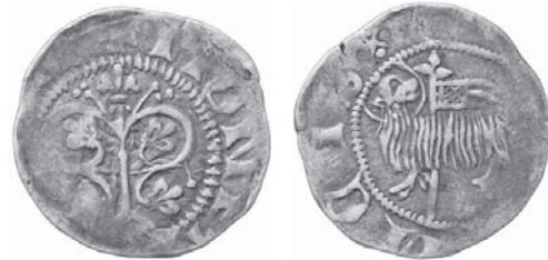
Fig. 70. Visby c.1340–1360, gote. Lily tree and pearled ring )( Gods lamb, legends: +MONETA CIVITATIS)(+WISBVCENCIS, 1.32 g, Ø 18 mm, LL XXXV:1c.

In principle, it is the same main type of W-bracteates that were coined for over 160 years. During this period, the type had different pearled edges and details, which could represent control marks of the coin issuer. The silver fineness for both the gotes and the bracteates severely declined in the 1440s.