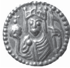
Fig. 4. Sigtuna, King Canute I (1167–1196), struck after 1180. Crowned bust facing with orb and banner, pearly edge, 0.33 g, Ø 15 mm, LL IA:2a.