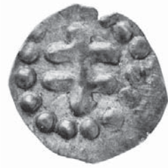
Fig. 2. Lödöse, Bishop Bengt the Good (1150–1190), struck after 1153. Double cross in a circle of pellets. 0.15 g, Ø 14 mm, LL –, Schive VI:48.