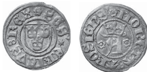
Fig. 61. Västerås, Regent Sten Sture the Older (1480–1497, 1501–1503), örtug. Shield with three crowns)(Crowned A, legends: SCS ERICVS REX)(MONETA AROSIS, 1.42 g, Ø 20 mm, LL 5b.