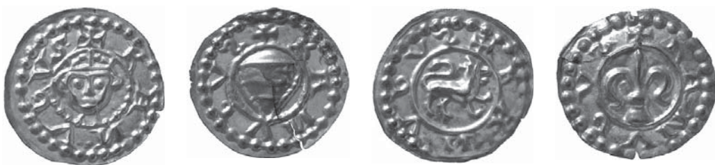
Figs. 27–30. Unknown mints (Svealand), Canute II the Tall (1229–1234). Crowned head in a pearled circle, +KANVTVS, 0.18 g, Ø 17 mm LL IV:A:2a. Shield in a pearled circle, +KANVTVS, unknown weight, Ø 18 mm LL IV:A:3. Lion to the left in a pearled circle, +KANVTVS, 0.34 g, Ø 18 mm LL IV:A:4. Lily in a pearled circle, +KANVTVS, 0.22 g, Ø 17 mm LL IV:A:5.

From the reign of King Canute II the Tall (1229–1234) as many as nine Svealand bracteate types were found in a coin hoard from Eskilstuna (Eastern Svealand). At least seven of them were issued by the king (Figs. 27–30) (legend: KANVTVS or ARVSAR) and one by Earl Ulf (legend: VI-CA) (see Fig. 34). Two further types may be dated to the reign of Canute II ( LL IVB and V ). This indicates that recoinage occurred annually or even more frequently in Svealand. No bracteates of Geatish monetary standard are known. Therefore, it is doubtful if Canute II was accepted as king in the whole Sweden. 70