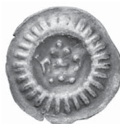
Fig. 56. Stockholm, King Magnus IV (1319–1363), struck 1354–63. Crown, ray edge, 0.33 g, Ø 17 mm, LL XXVIII:4a.