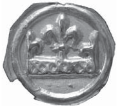
Fig. 22. Lödöse, King Eric XI (1222–1229, 1234–1250), struck 1240–1245. Crown, 0.19 g, Ø 13 mm, LL XVI:A:1.