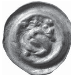
Fig. 65. Söderköping, King Albert of Mecklenburg (1364–1389). Crowned S, 0.29 g, Ø 15 mm, LL XXXIII:2a, Malmer KrSÄa.