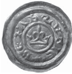
Fig. 25. Svealand, unknown mint, King Eric XI (1222–1229, 1234–1250), struck 1240s. Crown, +REX VPSALIE (retrograde), unknown weight, Ø 18 mm, LL VIII:2.