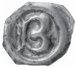
Fig. 35. Lödöse, Earl Birger (1250–1266). B in smooth edge, 0.13 g, Ø 12 mm, LL XVIIA:2a.

Earls only minted during the thirteenth century in Sweden. An example is a bracteate with a banner and the inscription VI-CA (abbreviation for vicarious). It has been assumed that Earl Ulf (1231–1248) was the issuer (Fig. 34). A specimen of this bracteate was found in the Eskilstuna hoard with bracteates from the reign of Canute II (1229–1234). It has the same style as the ones issued by King Canute. Another two bracteates with the inscriptions VLF JARL (LL VI:1) and WLF DVX (LL VI:2) refer to Earl Ulf. In the 1260s, Earl Birger (1250–1266) minted bracteates with the letter B in Lödöse (Fig. 35).