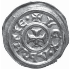
Fig. 24. Svealand, unknown mint, King Eric XI (1222–1229, 1234–1250), struck 1240s. Cross, +REX VPSALIE (retrograde), 0.37 g, Ø 19 mm, LL VIII:1.