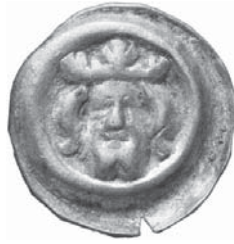
Fig. 63. Stockholm, King Albert of Mecklenburg (1364–1389). Crowned head facing, 0.33 g, Ø 14 mm, LL XXXII:2, Malmer KrHÄIli.