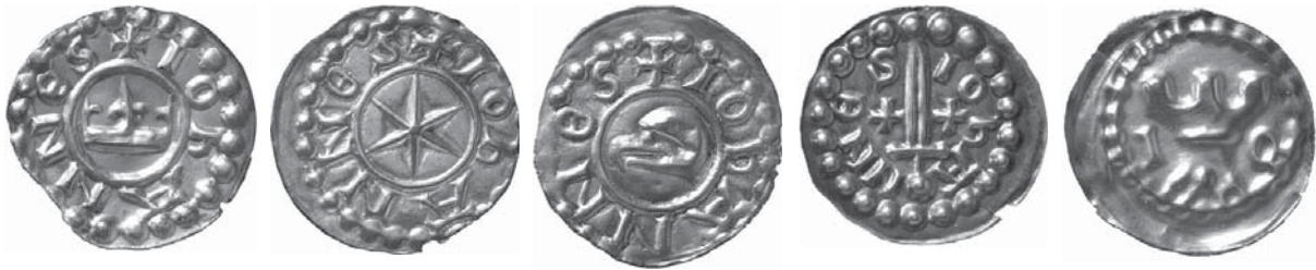
Figs. 13–17. Unknown mints, (Svealand), King John I (1216–1222).