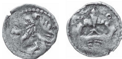
Fig. 52. King Magnus IV Ericsson (1319–1363), unknown mint, struck 1320–1340. Lion left)(Crown, 0.37 g, Ø 13 mm, LL XXVI:1a.

was maintained until the 1350s. 94 King Magnus IV (1319–1363) undertook coinage reform with a new type of two-faced coin (Lion left or right on the obverse and crown on the reverse) when he assumed the throne (Fig. 52) and undertook recoinage in 1340, when only the image of the coins (Lion left on the obverse and different letters or symbols surrounded by three crowns on the reverse) was changed (Fig. 53).