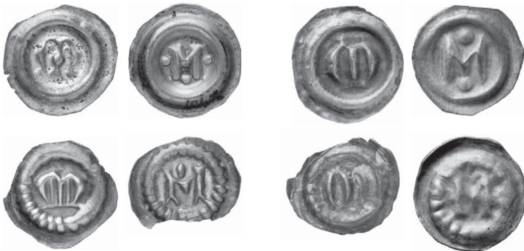
Figs. 42–49. 8 M-bracteates struck by King Magnus III Barnlock, (1275–1290). Upper row: First issue with smooth edge. Svealand LL X:1b, 0,28 g, Ø 15 mm; Svealand LL X:3c, 0,30 g, Ø 17 mm; Götaland LL XVIIIIC:1a, 0,12 g, Ø 14 mm; Götaland LL XVIIIIC:4c, 0,09 g, Ø 13 mm. Lower row: Second issue with ray edge. Svealand LL X:2f, 0,28 g, Ø 15 mm; Svealand LL X:4b, 0,30 g, Ø 18 mm; Götaland LL XVIIIIC:3, 0,13 g, Ø 13 mm; Götaland LL XVIIIIC:6a, 0,31 g, Ø 13 mm.

that eight types/variants had been minted, each in a different mint. 78 However, two other known mints, Lödöse and Kalmar, were not mentioned. 79