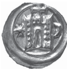
Fig. 19. Lödöse, King Eric XI (1222–1229, 1234–1250), struck 1234–1240. Church building between a star and half-moon, 0.16 g, Ø 13 mm, LL XII:C:6a.