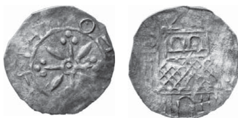
Fig. 68. Visby, c.1140–1160, penny. Wheel with eight spokes )( Church gable, vague inscriptions, 0.23 g, Ø 13 mm, LL XX:1a.

Minting in Gotland started around 1140 in Visby. During the next 80 years, two-faced simple thin coins were struck and dominated for long periods (Fig. 68). Between 1220 and 1245 a few other types were minted, but between 1245 and 1288 once again a uniform type was coined (Fig. 69). 103 These should have been long-lived coins. In the twelfth century, thin uni-faced coins were also struck. However, these are not bracteates, since they have not been struck with the same technology of a soft material under the flan. The weight and the fineness declined continuously in the period 1140–1220, especially after 1200. 104 The spread of Gotlandic pennies evidenced in hoards is relatively wide; they dominate the composition of coin hoards in both Eastern Götaland and the Baltic area. The large spatial dispersion of the coins across seas and rivers and the fact of the long temporal period of the minting together indicate the purpose was to use them effectively in trade and for the local markets. The coin issuing authority seems to have been primarily interested in the stability of the coinage. Therefore, a trade organisation or the city of Visby could well have been the issuer. 105