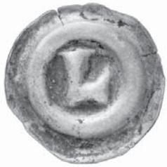
Fig. 58. Lödöse, King Magnus IV (1319–1363) or Albert of Mecklenburg (1364–1389), struck 1363–1365. L, smooth edge, 0.24 g, Ø 15 mm, LL XXX:3.