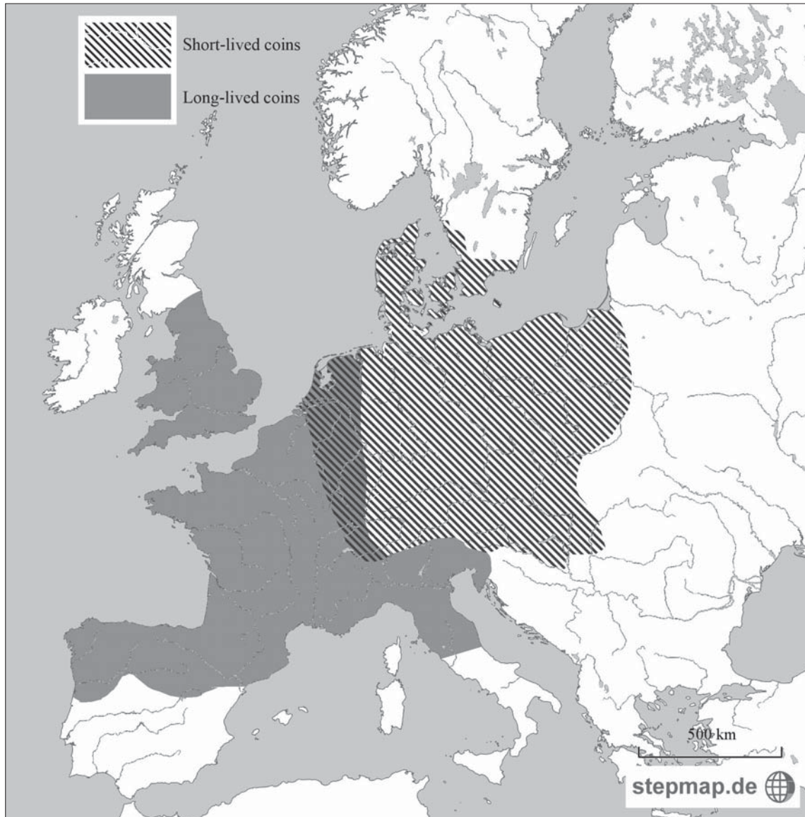
Map 1. Short-lived and long-lived coinage systems in Europe 1140–1300.

in international trade. The issuer hoped his coins would be perceived as so stable that neighbouring areas would confidently accept them as a means of payment. The coin issuer would thus gain a larger circulation area for his coins. With this expansion, he could strike more coins and make a higher profit. The most important source of income for the minting authority in such a system was probably the monopoly over the exchange of foreign coins and bullion for current local ones. 21