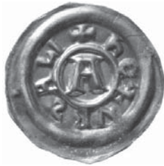
Fig. 26. Svealand, unknown mint, King Eric XI (1222–1229, 1234–1250), struck 1240s. A, +REX VBSALI, 0.32 g, Ø 18 mm, LL VIII:3.

From the reign of King Canute II the Tall (1229–1234) as many as nine Svealand bracteate types were found in a coin hoard from Eskilstuna (Eastern Svealand). At least seven of them were issued by the king (Figs. 27–30) (legend: KANVTVS or ARVSAR) and one by Earl Ulf (legend: VI-CA) (see Fig. 34). Two further types may be dated to the reign of Canute II ( LL IVB and V ). This indicates that recoinage occurred annually or even more frequently in Svealand. No bracteates of Geatish monetary standard are known. Therefore, it is doubtful if Canute II was accepted as king in the whole Sweden. 70