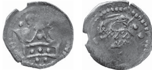
Fig. 51. King Birger (1290–1318), unknown mint. Crown)(S, both have a square design, 0.21 g, Ø 13 mm, LL XXIII:7a

In the coin hoards from the reign of Birger (1290–1318), there is not a single bracteate minted by Magnus III prior to 1290. Such clean hoards are difficult to find in continental Europe. This could be interpreted as if a coinage reform including recoinage had been undertaken in 1290, but no recoinage within the reign of Birger. Alternatively, people would have obeyed the orders of King Birger and exchanged all their old coins for new ones. However, there is another explanation of the fact that the bracteates of Magnus III are not found in hoards with two-faced coins of Birger Magnusson. We know that King Birger undertook drastic debasements of the fineness. The former bracteates have a higher fineness (80 per cent) than the two-faced coins (63 per cent) of Birger, and therefore, disappeared from circulation, either by export, melting down or serious hoarding (Gresham's Law).