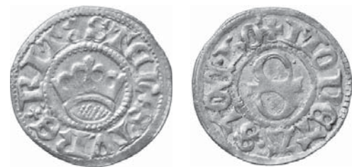
Fig. 62. Stockholm, Regent Sten Sture the Younger (1512–1520), half örtug. Crown)(S with line, legends: STEEN STVRE RIT)(MONETA STOCHO, 1.00 g, Ø 17 mm, LL 8a.

the early sixteenth century. The hohlpfennigs can thus be regarded as immobilised types (compare section 3.1.2). Malmer 100 has classified and dated them. Different details, the form of the design and not least the fineness all point to which king minted them. The Swedish hohlpfennigs are different from those in northern Germany by virtue of having a narrow edge that is always smooth. Similar to Germany, the relief of the Swedish bracteates became progressively elevated during 370 years (1153–1523).