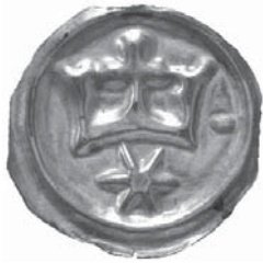
Fig. 23. Lödöse, King Eric XI (1222–1229, 1234–1250), struck 1234–1240. Crown above a star, 0.14 g, Ø 13 mm, LL XVI:A:2a.