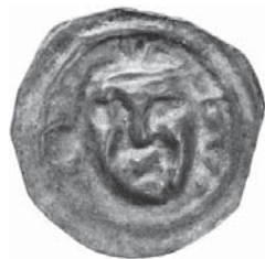
Fig. 6. Lödöse, King Canute I (1167–1196), struck after 1180. Crowned head, LE–DV, 0.12 g, Ø 13 mm LL XI:A:2.

land) in the period 1180–1196. 61 Thus, Canute I issued several types in both mints within a limited time (compare with method B in Table 1). These observations suggest that renewals occurred in both areas, but were more frequent in Svealand than in Götaland. Some of the bracteate types from Sigtuna and Lödöse in the period 1180–1196 are stylistically similar to each other, but so many types could not have been valid at the same time. It would only have caused confusion among a population, which earlier only had experienced foreign coins with different weights and fineness.