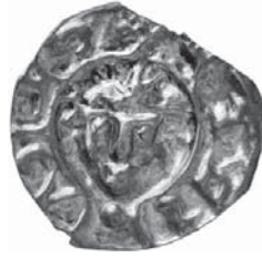
Fig. 12. Lödöse, King Eric X (1208–1216). Crowned head, ERICV–S REX (retrograde), 0.09 g, Ø 13 mm, LL XI:B:13.