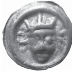
Fig. 64. Stockholm, King Christopher of Bavaria (1441–1448). Crowned head facing, 0.18 g, Ø 12 mm, LL XXXII:4b, Malmer KrHYIc.