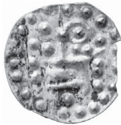
Fig. 31. Sigtuna (?), Archbishops of Uppsala (1190–1196). Hand with crozier in a pearly circle, 0.24 g, Ø 16 mm, LL IB:1c.

Normally, coinage was a royal monopoly or droit de rège in medieval Europe. However, as mentioned in section 2.2, the coinage right could be delegated to ecclesiastical or civil authorities, conditional on obeying the guidelines from the king. Delegation occurred mostly when royal power was relatively weak versus other groups (bishops and nobility), as was the case in Germany from 950–1300, Denmark from 1130–1157 and 1227–1340, and in Sweden from 1150–1275. Unsurprisingly, the Archbishops of Uppsala minted bracteates, probably in Sigtuna, in the period 1190–1215. 71 Thus for a quarter century the kings and the archbishops simultaneously coined bracteates in Svealand. The episcopal bracteate types have been dated to the end of the reign of Canute I (1190–1196), (Fig. 31), the reign of Sverker II (1196–1208), (Fig. 32) and Eric X (1208–1216), (Fig. 33). 72 The bracteate types of the kings and the archbishops have the same design and monetary standard, so they could circulate simultaneously. The coinage of bracteates continued in Sweden until 1290, but from 1215 onwards, there were no ecclesiastical coin issuers, indicating that royal power had strengthened its position against the church.