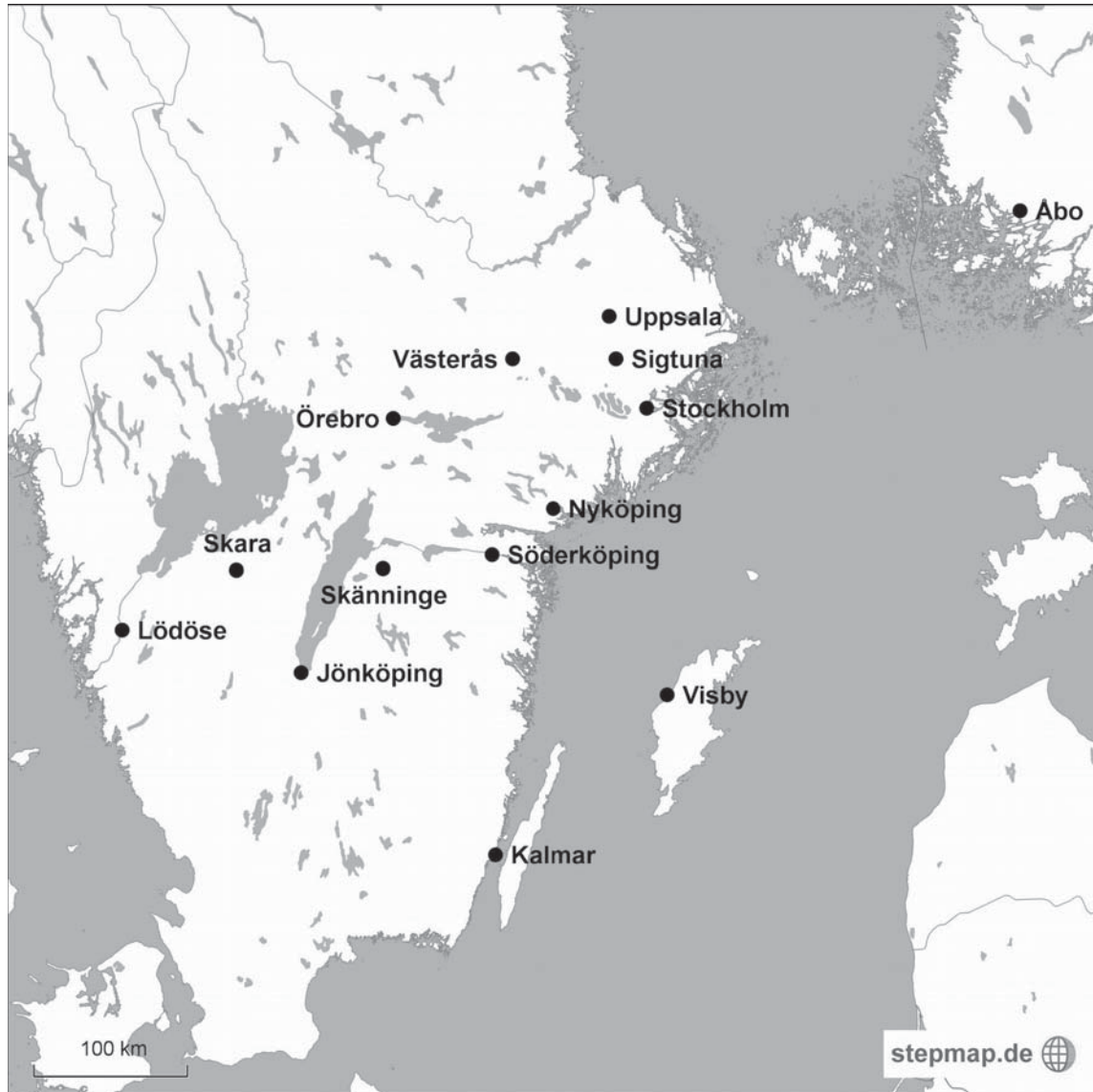
Map 3. Mints in medieval Sweden 1140–1523.

later would constitute ‘Sweden’ had none of its own minting for 120 years from 1030 to 1153. From around 1153 to 1290, the bracteate was the only minted coin type on the mainland.