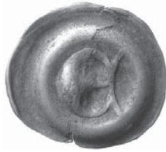
Fig. 57. Kalmar, King Magnus IV (1319–1363) or Albert of Mecklenburg (1364–1389), struck 1363–1365. E, smooth edge, 0.35 g, Ø 17 mm, LL XXX:1b.