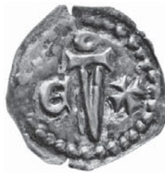
Fig. 18. Lödöse, King Eric XI (1222–1229, 1234–1250), struck 1222–1229. Sword between E and cross/x, 0.14 g, Ø 14 mm, LL XIII:4.