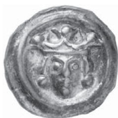
Fig. 36. Örebro, King Valdemar (1250–1275). Crowned head facing, 0.21 g, Ø 13 mm, LL XVII:1a.

King Valdemar (1250–1275) struck only six main types of Geatish bracteates. The bracteates on Figs. 36–40 were found in a large coin hoard in Styra, Eastern Götaland. Waste products from minting show that they had been coined in Örebro and Lödöse, respectively. However, these types are also frequently found in cumulative finds from churches, suggesting that their coinage volumes were considerable and that they may also have been struck in other mints. 74 No Svealand bracteates were minted by Valdemar.