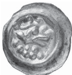
Fig. 38. Lödöse, King Valdemar (1250–1275). Crowned lion head left, 0.16 g, Ø 13 mm, LL XVII:4a.