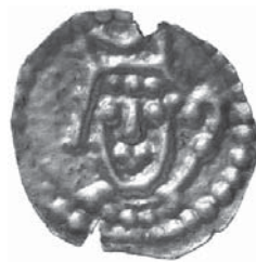
Fig. 32. Sigtuna (?), Archbishops of Uppsala (1200–1210). Bust of archbishop with mitre and crozier in a pearly circle, 0.24 g, Ø 18 mm, LL IB:2.