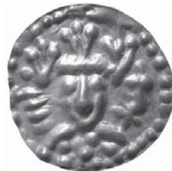
Fig. 8. Sigtuna, King Canute I (1167–1196), struck after 1180. Crowned head facing, degenerated style, 0.30 g, Ø 15 mm, LL IA:12.

It is unlikely that Canute I would have introduced bracteates in Svealand and Götaland without linking them to recoinage. There must have been an economic motive behind the various types – especially as all of them seem to have been struck in Sigtuna and Lödöse. As discussed in section 3.3, there are strong links between bracteates and periodic recoinage. One should also remember that Ca-