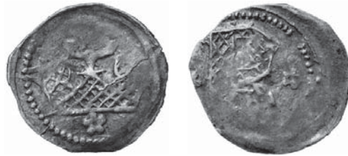
Fig. 50. King Birger (1290–1318), unknown mint. Crown)(B, both have a square design, 0.34 g, Ø 13 mm, LL XXIII:1.

However, it is very dubious if the types with different letters mark any variation in time. A very important empirical observation – that not a single variant of the crowns on the obverse can be found on two coins with different letters on the reverse 93 – suggests that periodic recoinage was brought to an end in Sweden in 1290.