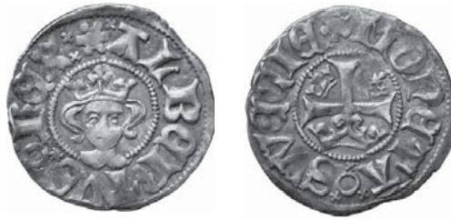
Fig. 60. Stockholm, King Albert of Mecklenburg (1364–1389), örtug. Crowned head) (Cross with three crowns, legends: ALBERTVS REX)(MONETA SWECIE, 1.38 g, Ø 19 mm, LL 4b.