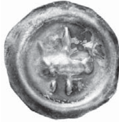
Fig. 41. Svealand, unknown mint, King Magnus III Barnlock (1275–1290). Crown, 0.27 g, Ø 17 mm, LL IX:6.

that eight types/variants had been minted, each in a different mint. 78 However, two other known mints, Lödöse and Kalmar, were not mentioned. 79