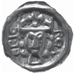
Fig. 21. Lödöse, King Eric XI (1222–1229, 1234–1250), struck around 1240. Crowned head, REX ERIC, 0.15 g, Ø 14 mm, LL XV:1.