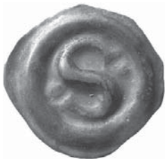
Fig. 59. Söderköping, King Magnus IV (1319–1363) or Albert of Mecklenburg (1364–1389), struck 1363–1365. S, smooth edge, 0.27 g, Ø 13 mm, LL XXX:4b.