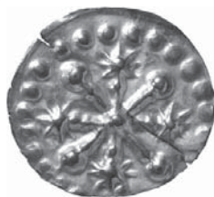
Fig. 11. Unknown mint (Svealand), King Eric X (1208–1216). Cross in a pearled circle, two diagonal sceptres with stars, 0.36 g, Ø 16 mm, LL IB:5a.

Six Svealand and two Geatish bracteate types have been attributed to the reign of King John I (1216–1222) (Figs. 13–17). These types are very rare in coin finds, but all of them were represented in the Dimbo hoard (Western Götaland).