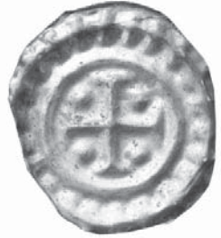
Fig. 3. Lödöse? Anonymous issuer, ca. 1160–1170. Cross in a circle of pellets. 0.09 g, Ø 14 mm, LL –, compare Schive VII:90.

coinage right between a Swedish ‘king’ and the Bishop of Skara is therefore a reasonable alternative (compare with Germany in Svensson 2013b). 54 If the Bishop of Skara is the only issuer of the bracteate, the king could mint in Lödöse simultaneously (compare with section 4.5).