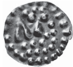
Fig. 5. Sigtuna, King Canute I (1167–1196), struck after 1180. Degenerated crowned head facing with sword left, design in pellet form, 0.18 g, Ø 16 mm, LL IA:9a.