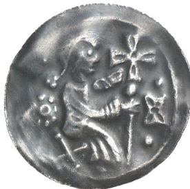
Fig. 2. Bracteate from Nordhausen c. 1130–1140 struck with a positive die from the reverse. 24 mm and 0.94 g.

Another reason to that bracteates are counterfeited relatively seldom is the low prices of bracteates on the collector market. Most medieval bracteates are anonymous and without legends and are thereby difficult to classify. Skilled knowledge is required to collect them, which presses the prices downwards. Therefore, counterfeiters have limited economic incentives to concentrate on bracteates. Instead, the focus is more often on more valuable coins from antiquity or the period 1500–1800.