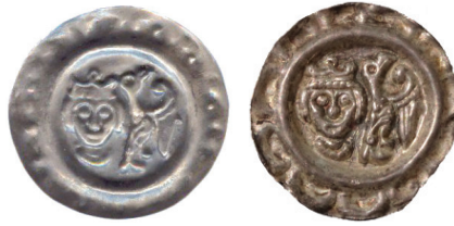
Fig. 19a and 19b. Forgery and original bracteate from Donauwörth, Emperor Friedrich II, 1215–50. Catalogue: Steinhilber 125. Forgery: c. 23 mm and c. 1.00 g. Original: 23 mm and 0.83 g.