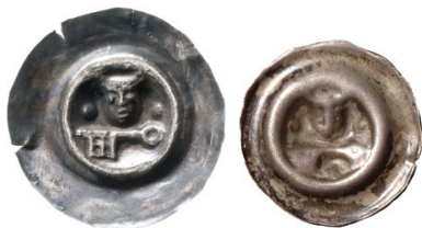
Fig. 5a and 5b. Forgery and original bracteate from Bremen, Bishop Hildbold von Wunstorf, 1258–73. Catalogue: Leschhorn 6558, Kestner 67. Forgery: 23 mm and 0.39 g. Original: 19 mm and 0.57 g.