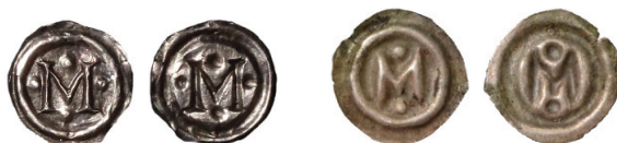
Fig. 14a and 14b. Forgery and original bracteate from King Magnus III Barnlock (1275–90). Forgery: 13 mm and 0.07 g. Original: 14 mm and 0.10 g.