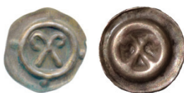
Fig. 18a and 18b. Forgery and original bracteate from Kołobrzeg (Pomerania), Bishops of Kamień Pomorski, c. 1300. Catalogue: Dannenberg 101a. Forgery: Unknown diameter and weight. Original: 14 mm and 0.31 g.