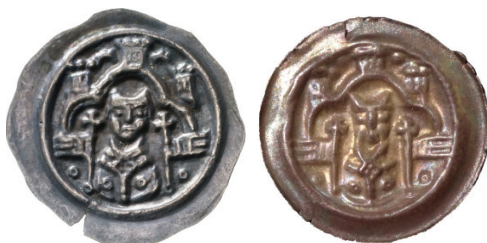
Fig. 6a and 6b. Forgery and original bracteate from Hildesheim, Bishop Konrad II or successors, 1240–60. Catalogue: Leschhorn 6481, Mehl (Hildesheim) 135. Forgery: 27 mm and 0.72 g. Original: 26 mm and 0.67 g.