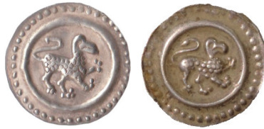
Fig. 20a and 20b. Forgery and original bracteate from Memmingen, anonymous emperor, 1260–70. Catalogue: CC 244. Forgery: Unknown diameter and weight. Original: 20 mm and 0.47 g.