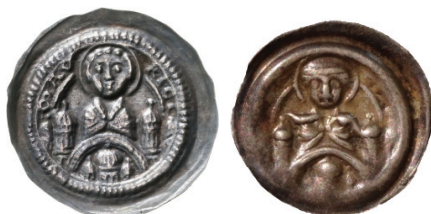
Fig. 7a and 7b. Forgery and original bracteate from Magdeburg, Archbishop Wichmann von Seeburg, 1152–92. Catalogue: Leschhorn 6487, Mehl (Magdeburg) 287. Forgery: 24 mm and 0.42 g. Original: 22 mm and 0.87 g.