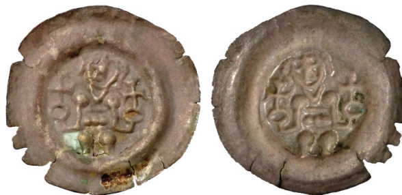
Fig. 4. Contemporary bracteate forgery with very low silver fineness struck by an outsider. 24 mm and 0.41 g.

and the weight were correct, but the fineness would be below standard. If an outsider made the forgeries, then the forgeries differ from the originals across the board — in terms of design and style, technology and legends. 4 Fig. 4 shows such a contemporary bracteate forgery with low silver fineness struck by an outsider with a false die.