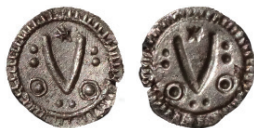
Fig. 12. Imaginary bracteate (V) from the eighteenth or nineteenth century. 14 mm and 0.27 g.