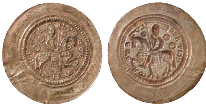
Fig. 10. Seeländer-forgery of a Luteger-bracteate from Altenburg. LVT EGE RM ECIT AEC. Compare with Kestner 2972. 38 mm and 0.85 g.

There are forgeries of Swedish bracteates and imaginary Swedish bracteates that were produced in the eighteenth and nineteenth centuries. The imaginary bracteates often have a single letter as the main design (see Figs. 11 and 12). However, there are also forgeries of original bracteates (see Figs. 13–15). These forgeries have a clumsy style, fine stamp design and details that do not flow together. They also lack soft contours on the reverse, since they have often been struck with a positive die from the reverse.