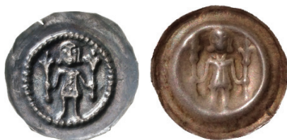
Fig. 16a and 16b. Forgery and original bracteate from Anhalt, anonymous margrave, 1245–1300. Catalogue: Leschhorn 6535, Thormann 338. Forgery: 21 mm and 0.42 g. Original: 22 mm and 0.87 g.