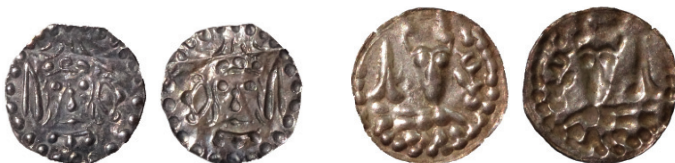
Fig. 13a and 13b. Forgery and original bracteate from King Canute I (1167–96). Forgery: 16 mm and 0.12 g. Original: 18 mm and 0.37 g.