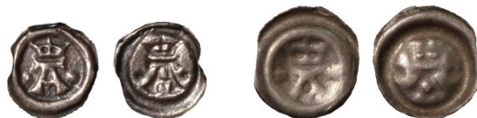
Fig. 15a and 15b. Forgery and original bracteate from King Sten Sture the Elder (1470–97 and 1501–03). Forgery: 12 mm and 0.09 g. Original: 14 mm and 0.22 g.