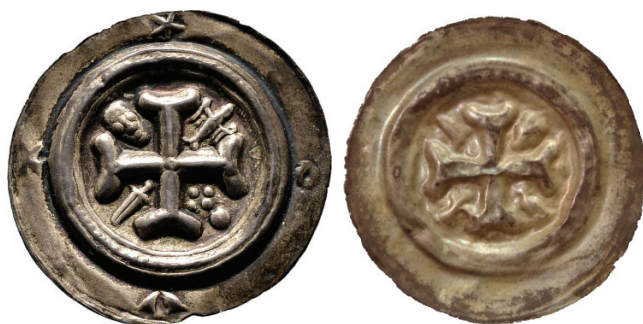
Fig. 8a and 8b. Forgery and original bracteate from Groitzsch, Advocate Dietrich von Sommerschenburg, 1190–1207. Catalogue: Posern-Klett 1161. Forgery: 36 mm and 0.91 g. Original: 35 mm and 0.85 g.