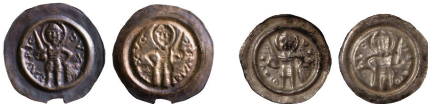
Fig. 9a and 9b. Forgery and original bracteate from Magdeburg, Archbishop Burckard von Woldenberg or Wilbrand von Käferburg, 1232–35 / 1235–54. MAVRIC-DVX. Catalogue: Thiel 158 and Mehl (Magdeburg) 595. Forgery: 23 mm and 0.43 g. Original: 21 mm and 0.74 g.

The Seeländer bracteates also have sharper contours in the design on the reverse of the bracteates compared to original bracteates, which have softer and more blurred contours (see Figs. 9, 10 and 22–30 on Plate).