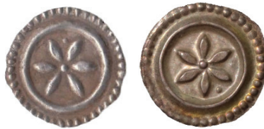
Fig. 21a and 21b. Forgery and original bracteate from Markdorf, anonymous counts, c. 1250. Catalogue: CC 254. Forgery: Unknown diameter and weight. Original: 20 mm and 0.38 g.

Finally, there are a final criterion used to identify bracteate forgeries. The forgeries often have empty fields or areas in the background that are not utilized (Figs. 18, 20 and 21). Since medieval bracteates were strongly linked to periodic recoinage (at least until c. 1300), it was necessary to change the design of the bracteates between issues. 6 The mint masters and die cutters then needed to utilize the whole miniscule area of the bracteates, displaying a plenitude of different symbols and details, so people could see the difference between valid and invalid issues. One conclusion that can be drawn is that modern counterfeiters do not know that bracteates were linked to renovatio monetae .