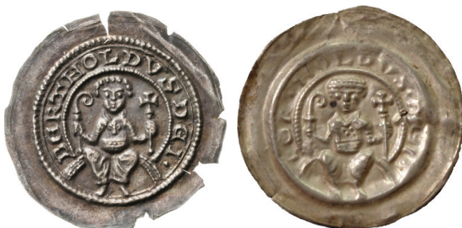
Fig. 17a and 17b. Forgery and original bracteate from Naumburg, Bishop Berthold II, 1186–1206. Catalogue: Leschhorn 6576, Kestner 1988. Forgery: 36 mm and 0.87 g. Original: 37 mm and 1.00 g.